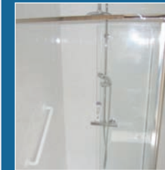
The shower temperature is safely controlled to prevent scalding