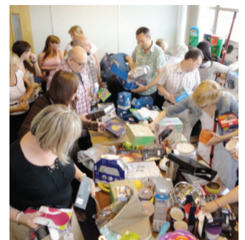
The Faversham House boardroom looked more like a market stall

The Faversham House Group charity sale took place in the summer – it was organised by DIY Week and Housewares Magazine and thanks to all the products donated was the biggest yet.